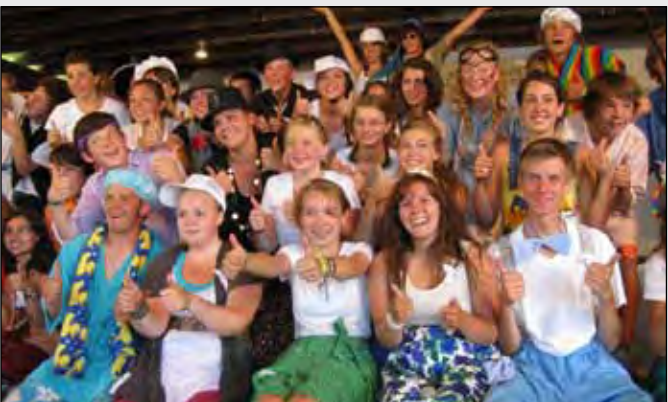
Participants of Arts-In, a musical production of the Washington County 4-H. Youth ages 13-19 engaged in the cast, band and technical crew.

Questions from interested applicants are welcomed.