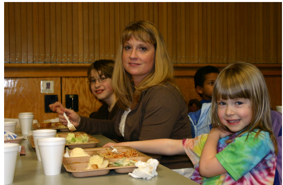
Family enjoying dinner at Loaves & Fishes

* Funded by the Eugene U. and Mary F. Frey Family Fund of The Saint Paul Foundation