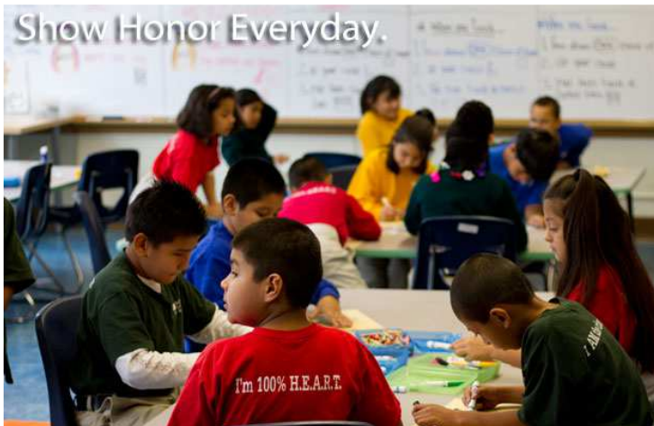
Hiawatha Leadership Academy high achievers!