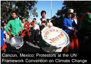
Cancun, Mexico: Protestors at the UN Framework Convention on Climate Change