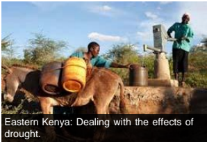
Eastern Kenya: Dealing with the effects of drought.