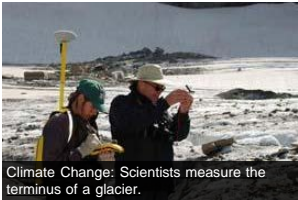
Climate Change: Scientists measure the terminus of a glacier.

While individual developing countries can struggle to make their voices heard in international forums, they gain strength by combining forces on shared interests. One long-standing example is the Group of 77, the largest intergovernmental organization of developing countries in the United Nations. It was founded by 77 developing country signatories at the first session of the United Nations Conference on Trade and Development in 1964, and has since grown to include 131 nations from the global South. Member countries act collectively to enhance their negotiating capacity on major economic issues within the UN system. The coalition has been vocal on climate change issues, which it views in the context of sustainable development. In February 2008, then-chairman of the Group of 77, John W. Ashe said, “It is imperative that our discussion reinforces the promotion of sustainable