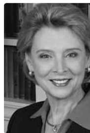
Washington State governor Christine Gregoire

“We are trying to drive up quality and safety while driving down cost. Proper staffing is an absolute key.”