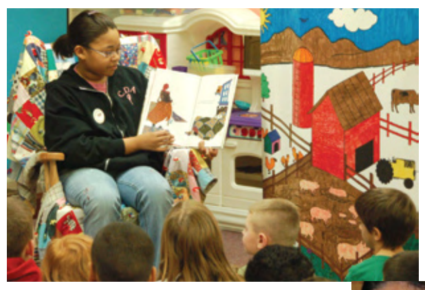
Right to Read