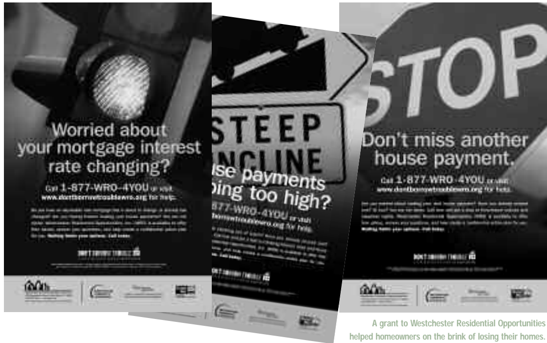
A grant to Westchester Residential Opportunities helped homeowners on the brink of losing their homes.