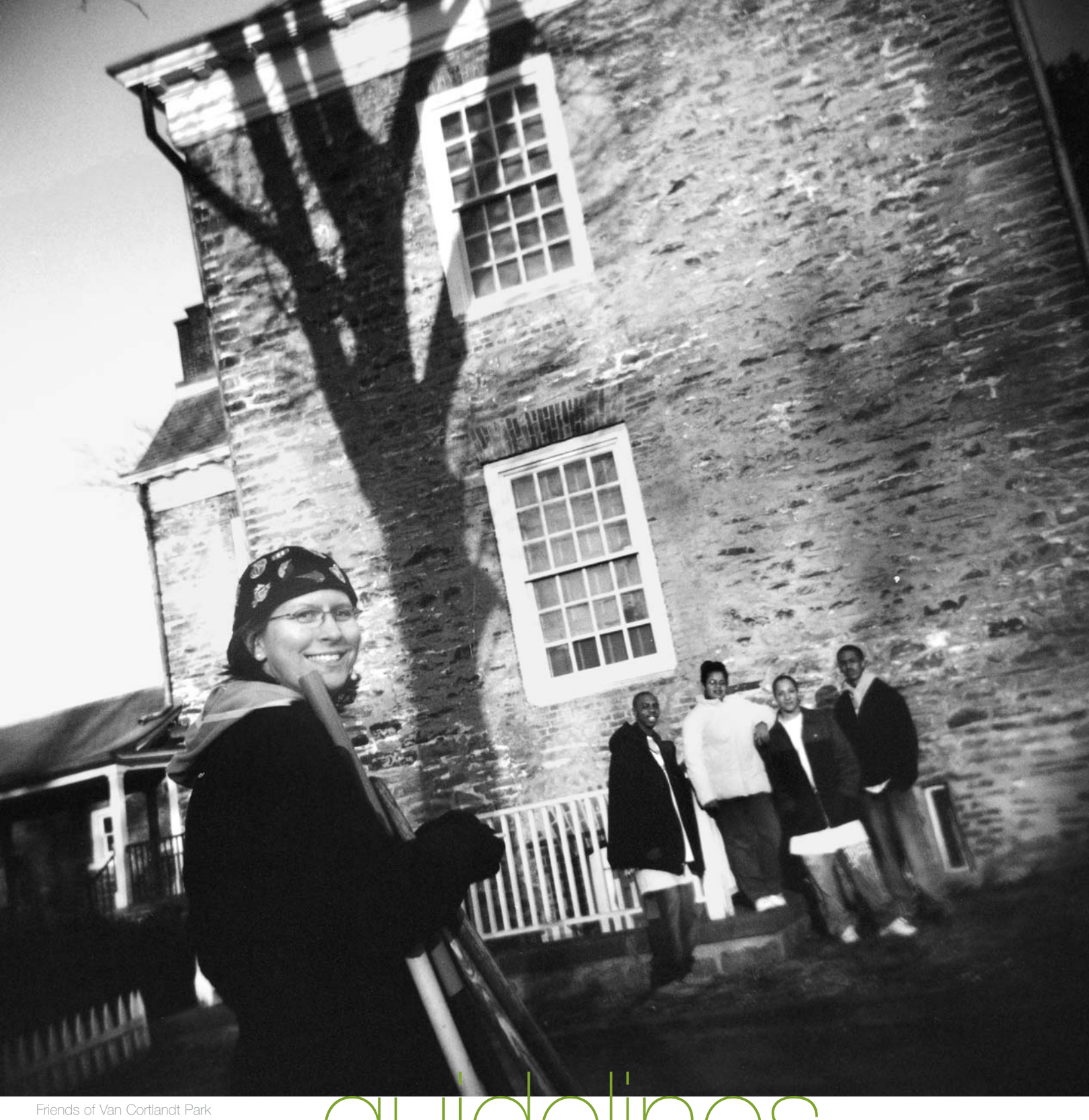
GUIOEINES for attorneys