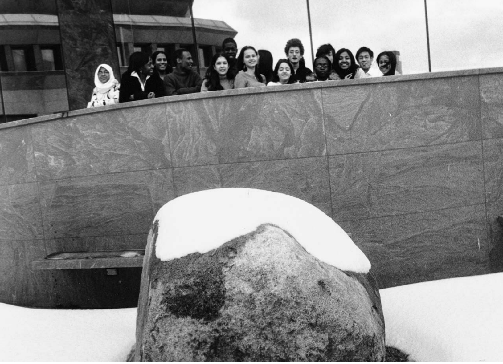
Museum of Jewish Heritage

This annual report will focus on four projects; virtually all of the kids who participate are from low-income families, and some have no families at all. We visited the programs and talked with the kids about their experiences. We hope you'll be as proud and inspired as we are by their accomplishments.