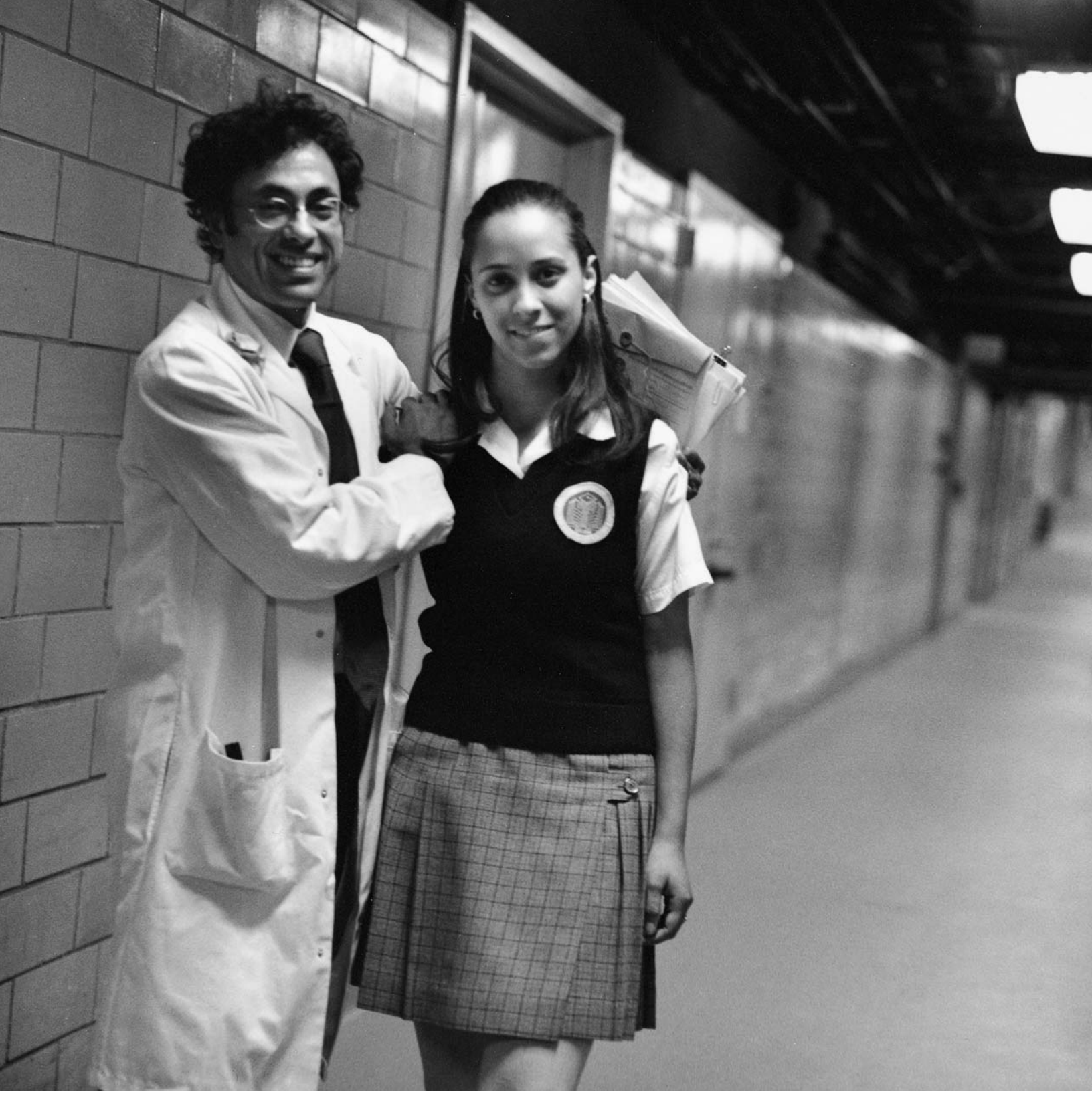
Harlem Children Society