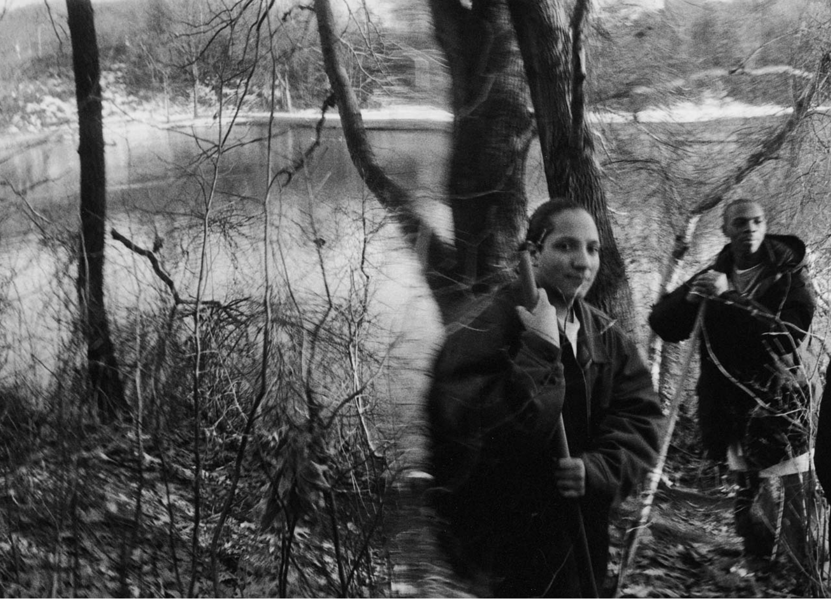
Friends of Van Cortlandt Park

"At first, I was interested in art. But I'm good in math, so I did some research and decided that mechanical engineering combines both my interests; my internship has just confirmed that this is what I want to do. I'm also on a team that builds robots and we compete in a national competition. I got a $100,000 scholarship from one of the colleges I applied to, but I turned it down when I found out it wasn't that strong in my field. It was really hard to do, but I'm determined to go to the best college for me."