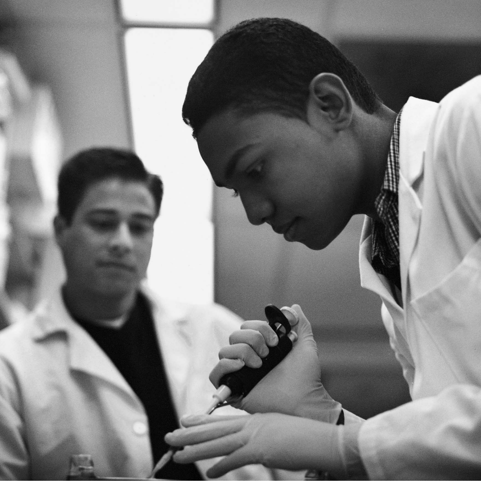
Harlem Children Society