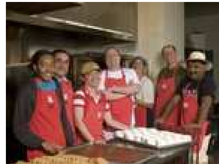
Open Arms Baking Crew