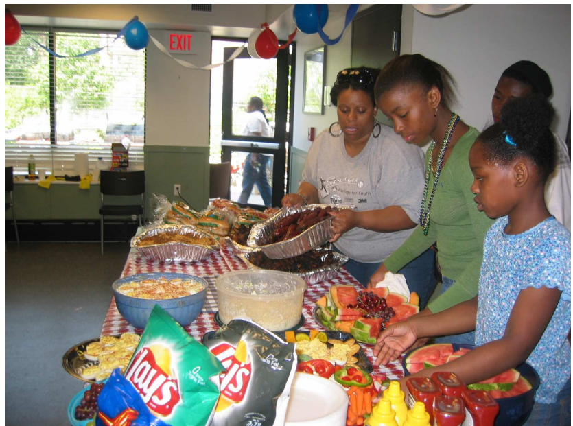
New Foundations Event

* Funded by the Eugene U. and Mary F. Frey Family Fund of the The Saint Paul Foundation