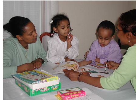
Minnesota Literacy Council ELF Program