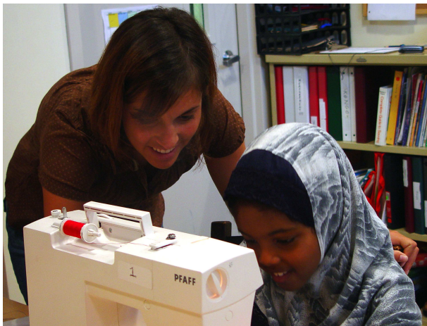
Confederation of Somali Community of Minnesota