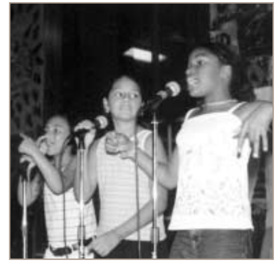
Salvation Army of Greater New York New York, New York $25,000 www.salvationarmy-newyork.org

The first year of a three-year grant totaling $150,000 for the Youth Empowerment Program, a youth leadership development program for the rural and migrant communities of eastern New York.