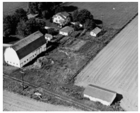
Preserving our local farms is not tomorrow's problem. Our farmland is vanishing at a rate of 10 percent every five years.

The Macomb Agricultural PDR Committee hosted a very successful "Planning with PUD's in Mind" informational workshop in the spring of 2004 thanks to a grant from the Foundation. Media and key people in the communities that impact building and planning attended the meeting generating much publicity and a new interest in the issues at hand.