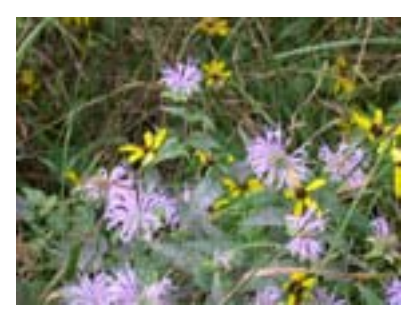
Purple Loosestrife choking out the native Blackeyed Susan.

While clearing the Purple Loosestrife, Seven Ponds will also be clearing other invasive species they have spotted. They include Dame's Rocket, Garlic Mustard, Glossy Buckthorn, and the Autumn Olive. Through this project, Seven Ponds hopes to bring greater attention to the problem of invasive species to our communities. The "nature" of Seven Ponds is experiencing and learning .