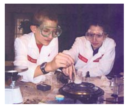
Romeo students working at their Science Olympiad project.

The clinic is run by local volunteers from the medical community. Their dedication is to be commended; they are heroes in our community.