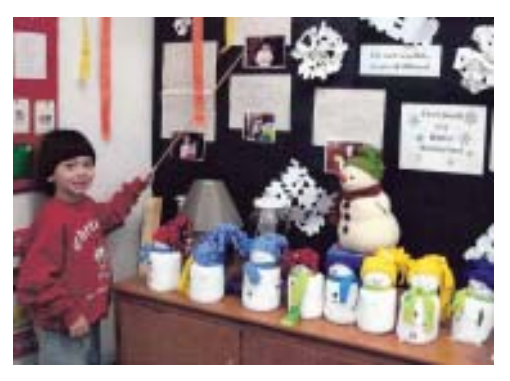
A Kingsbury student points to his photograph and the story he composed about the event in the picture.

The writing continued until there was enough to compile a book that made its rounds to conferences and eventually a home in the library.