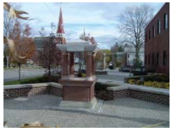
In this view of the Pocket Park, we see the parkbenches thoughout the beautiful landscaping behind the fountain monument.