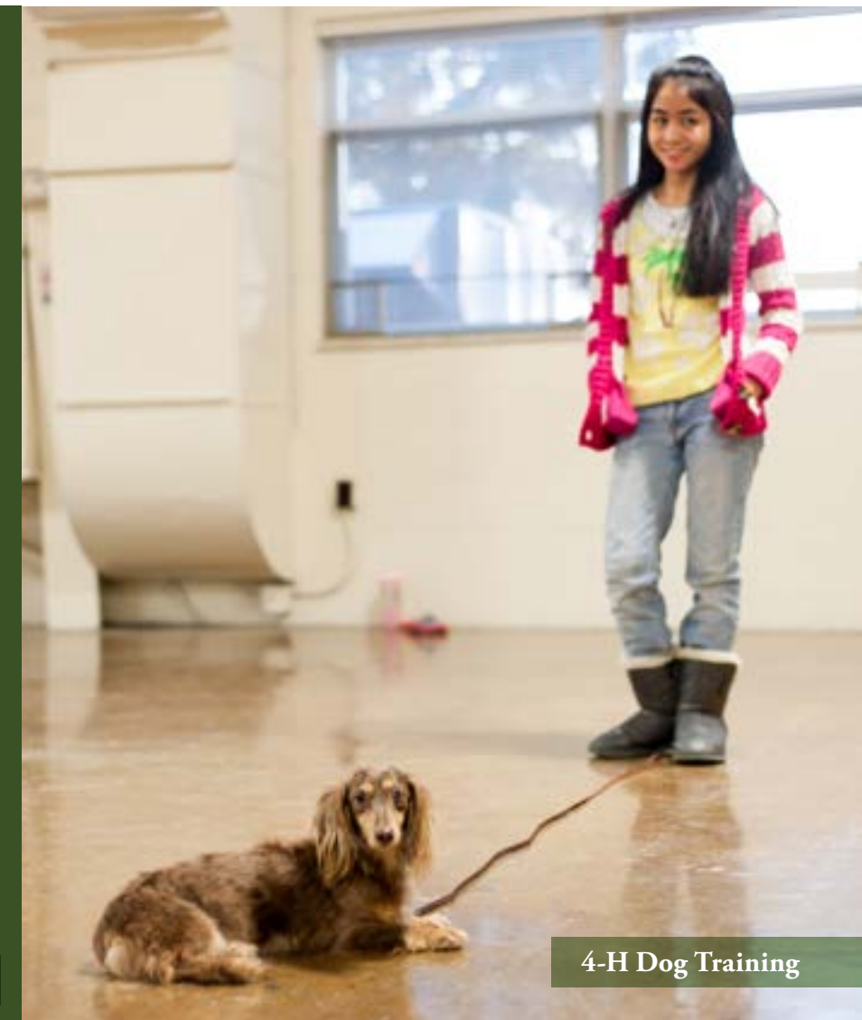
4-H Dog Training