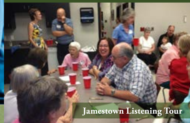
Jamestown Listening Tour