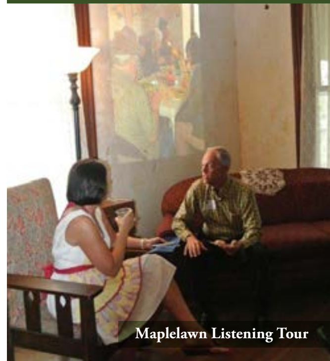
Maplelawn Listening Tour