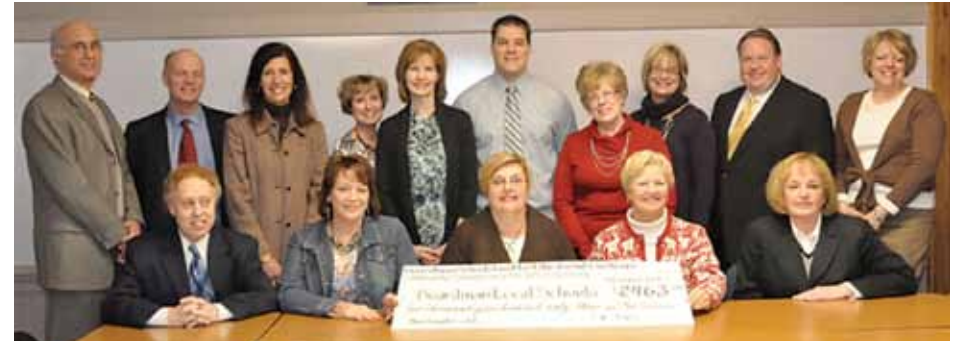
The BSFEE Board of Trustees and the five inaugural recipients of the Teacher Mini-Grants program.