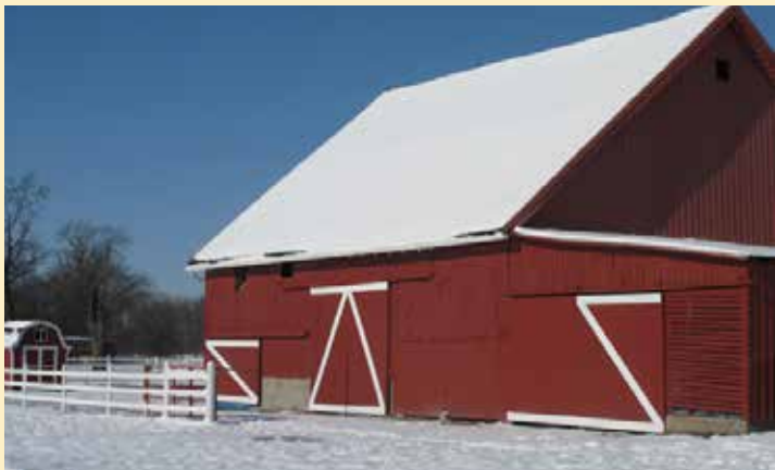
Before and After photos of Edelweiss Headquarters