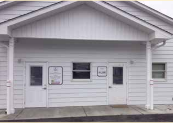
Before and After photos of HCCF’s North Entrance