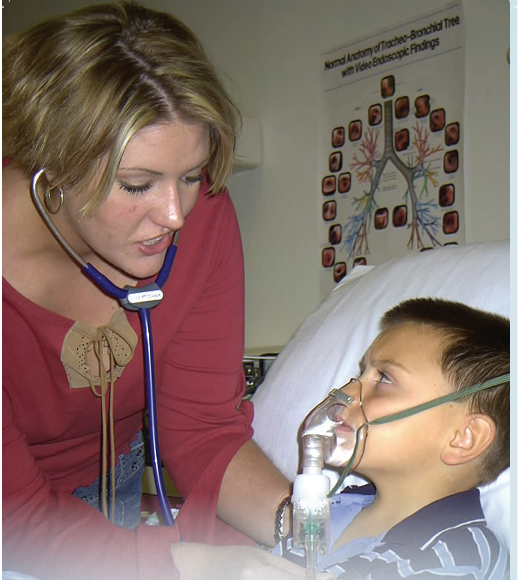
A grant from the San Angelo Health Foundation provided match funding to expand the Howard College - St John's Campus adding classroom and lab space for their nursing programs.