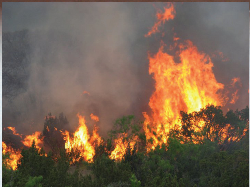
The Wildcat Fire destroyed approximately 160,000 acres in Coke and Tom Green Counties in April 2011. To maintain the safety of residents and sustain tireless efforts of volunteers, the San Angelo Health Foundation and San Angelo Area Foundation jointly funded $184,000 to 35 area volunteer fire departments.